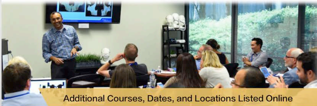
Additional Courses, Dates, and Locations Listed Online