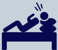
TMD FOR DENTAL SLEEP MEDICINE