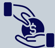
MEDICAL BILLING FOR SLEEP APNEA